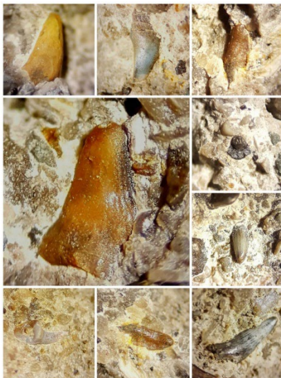
Photo 1: Microscopic fossils from Hungry Hollow, in Arkona, Ontario.