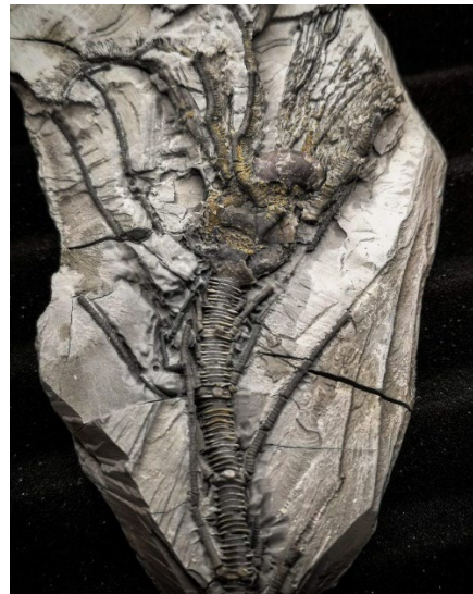
Photo 2: Beautiful crinoid fossil found at Hungry Hollow, in Arkona, Ontario.